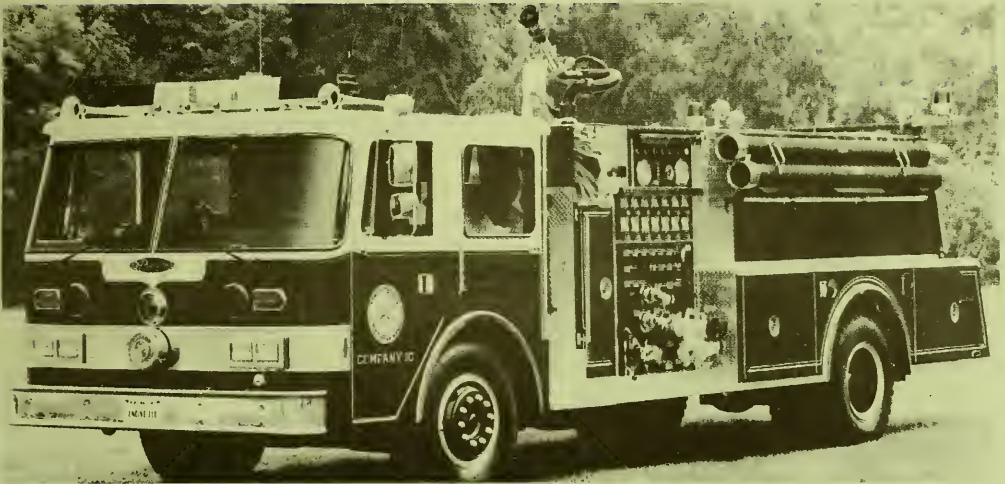
Facsimile of Fire Truck to be delivered in June, 1987