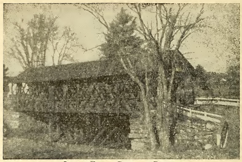
SHORT FALLS COVERED BRIDGE