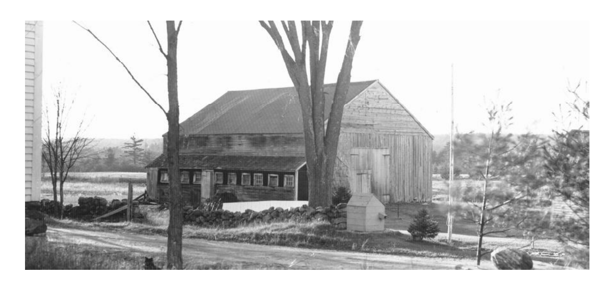
Barn that accompanied the Worth House